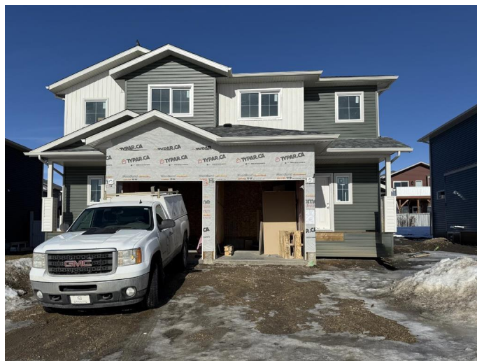
The Oxford II Duplex Unit with basement suite 1,337 s.f./ 1,316 s.f.