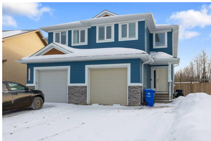
169 Shalestone Way, Fort McMurray, AB

Upstairs, youâ€™ll find TWO primary bedrooms, each with its own ensuite! The main bathroom is a 4-piece ensuite for the second bedroom. Amazing dual function and perfect for guests or a growing family. There is a third bedroom upstairs, also great for